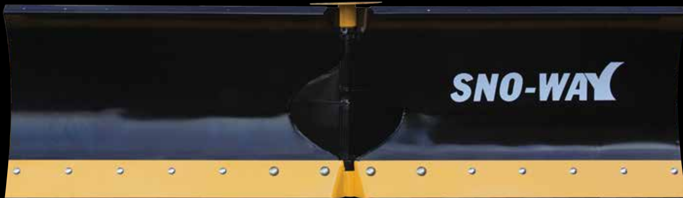
29VHD Shown With Optional Sno-Way® 9" E-Z Switch Scoop Wings