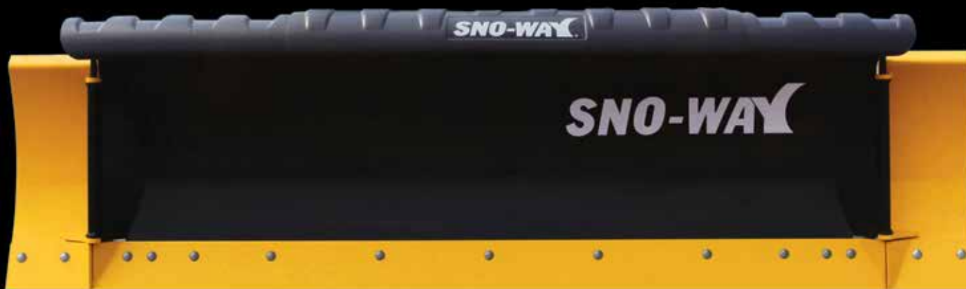
29R Series is shown with the optional E-Z Fit Deflector