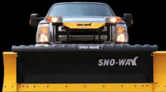
29R Series is shown with the optional E-Z Fit Deflector

The 29R stands out from the crowd with the greatest possible snow moving flexibility and capacity for a plow mounted to a 3/4 ton truck. No more machine limitations! The "R" in the model identifier refers to the Revolution series of plows. These plows are designed with patented hydraulic end wings that can be controlled together or independently to move the snow where you want it at any time. Each wing can be moved from a straight out position into a 90 degree orientation to the main blade – effectively creating a box plow. This patented dual-hinge plow design provides you the ability to move up to 4.8 cubic yards of snow which is double the closest competitor's V plow or expandable plow! Engage the Patented Down-Pressure® Hydraulics System that increases snow moving capacity another 30% and you have the ultimate snow clearing machine.